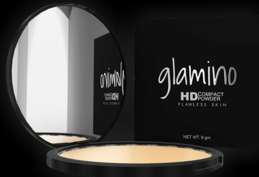
Compact Powder (Midnight Choco 102)