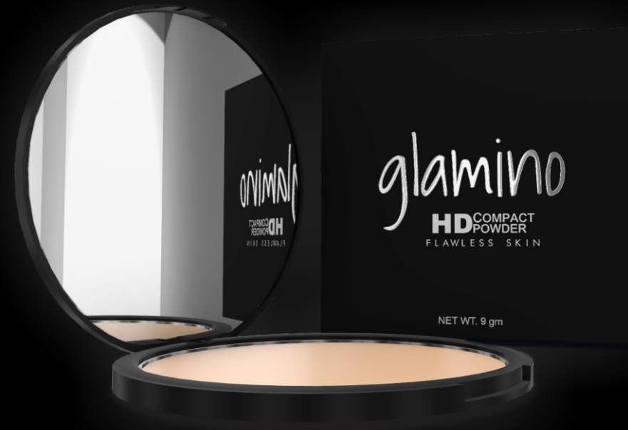
Compact Powder (Light Fairy 101)